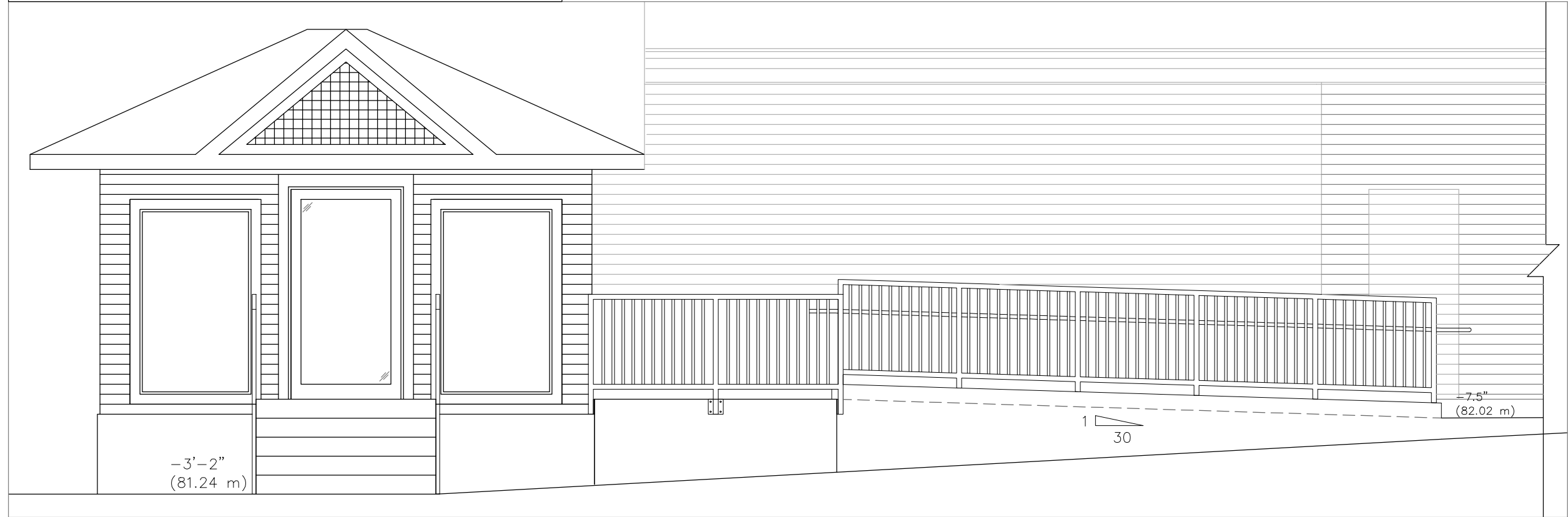
1 STAIR B AND RAMP - ELEVATION A-601C SCALE 1/4" = 1'