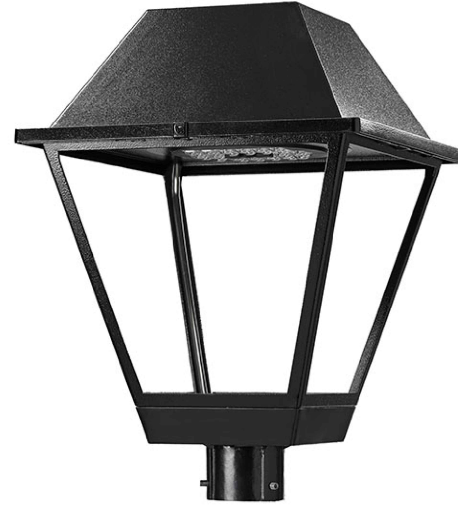
TYPICAL POST TOP MOUNTED LIGHT FIXTURE