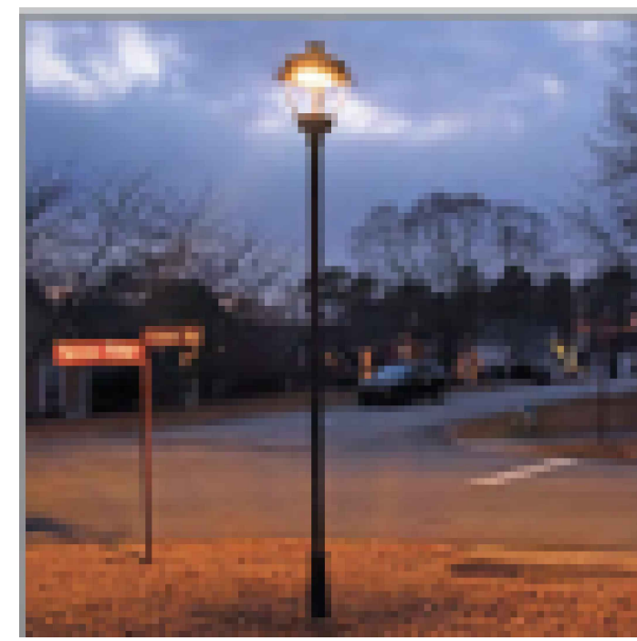
TYPICAL POST TOP MOUNTED LIGHT FIXTURE