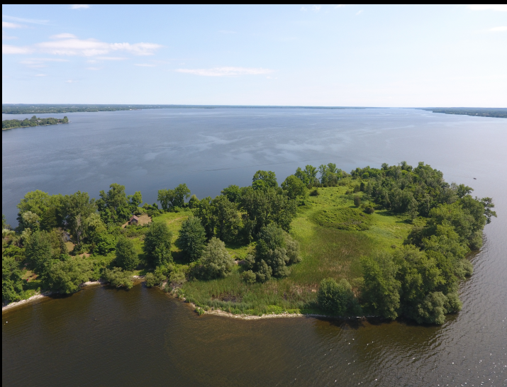
Grape Island

Shahwundais (or John Sunday) was a Mississauga chief and veteran of the War of 1812 who converted to Methodism in 1826. Soon after, he founded the Grape Island Mission. He is said to have been very charismatic, and by 1828 there were over 200 people practicing Methodism on Grape Island. John Sunday travelled to England in 1837 to plead the cause of Indigenous missions, even meeting with Queen Victoria herself, but by this time the mission on Grape Island had already closed, and its members had relocated. Some went to Kingston, and others migrated to the Rice Lake area (now Alderville First Nation).