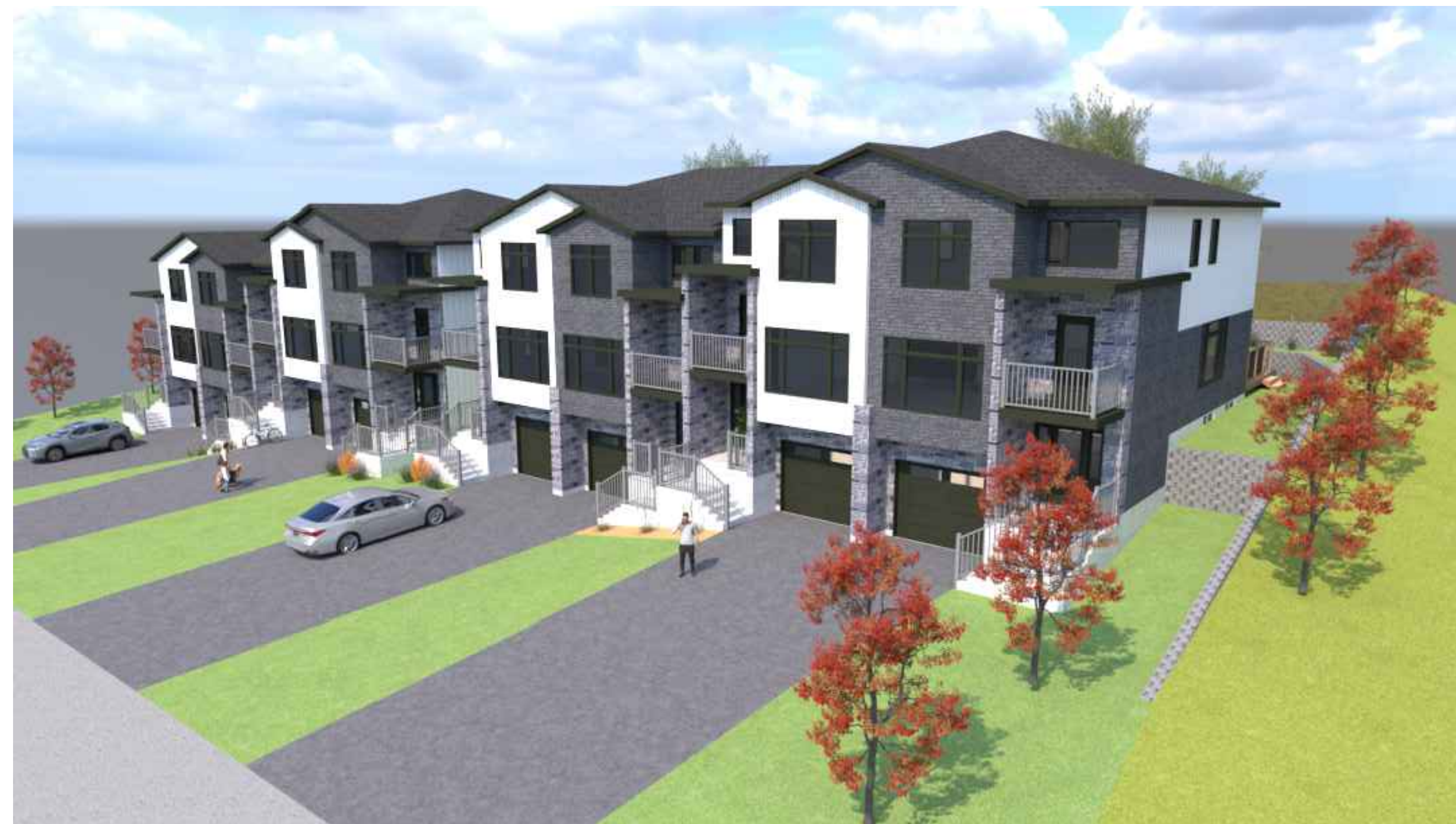
4 FROM SOUTHWEST SCALE: N/A