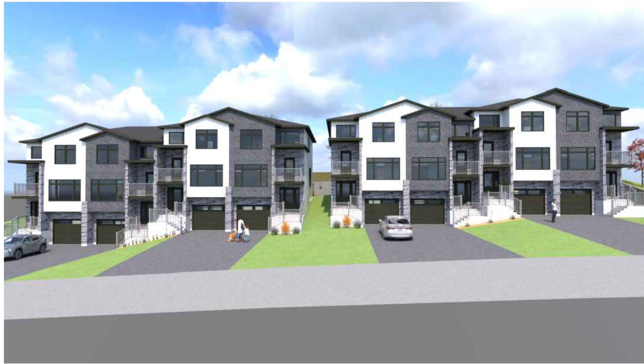
1 FROM SOUTH SCALE: N/A