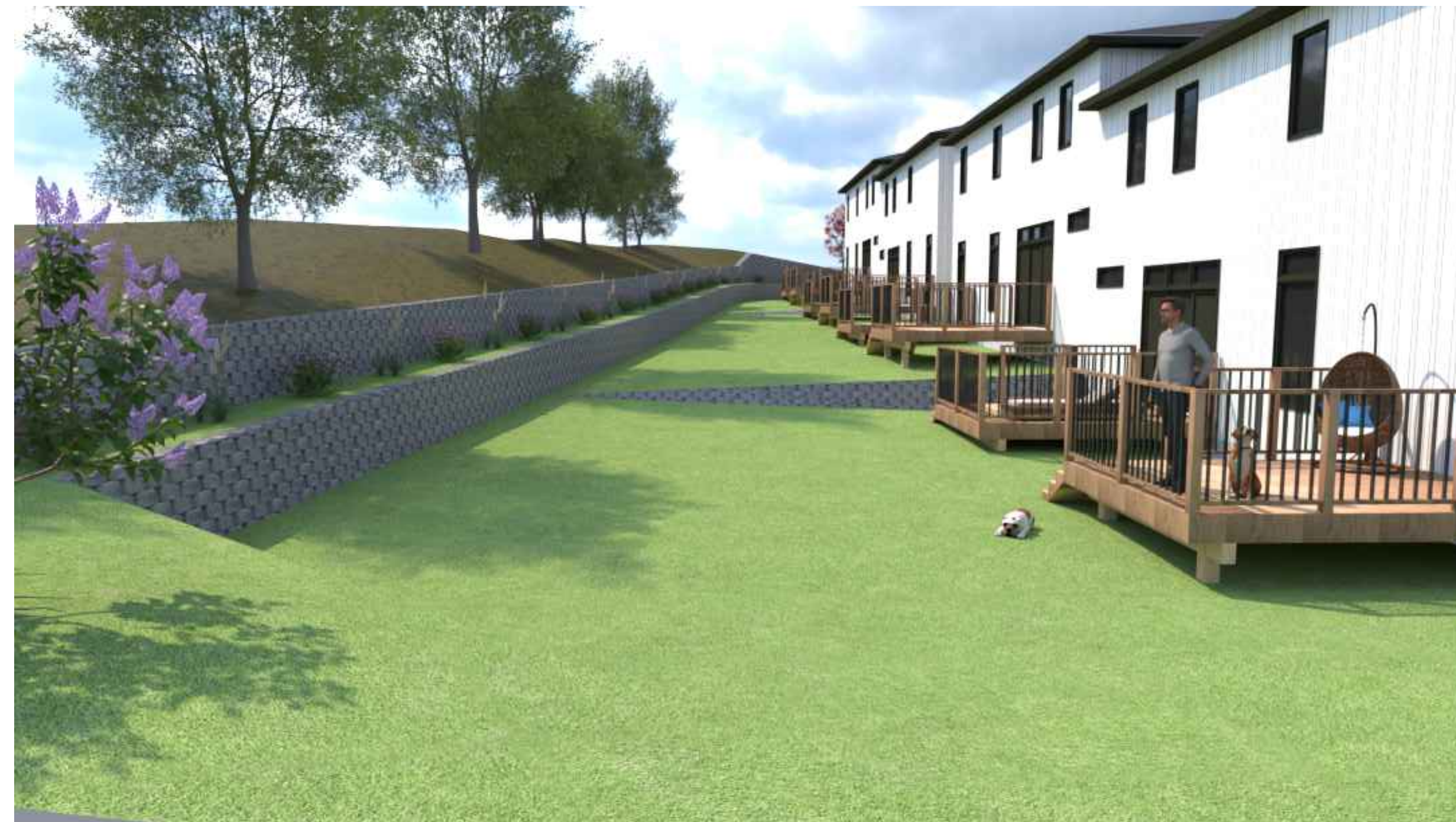
3 FROM EAST SCALE: N/A