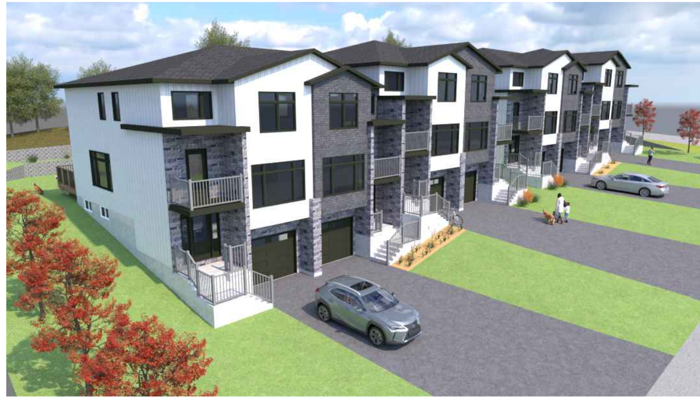
2 FROM SOUTHEAST SCALE: N/A