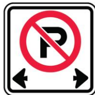
RB-51 No Parking Sign